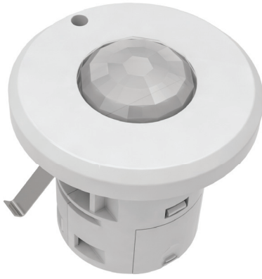
EAN code DMD3-1: 8595188157513