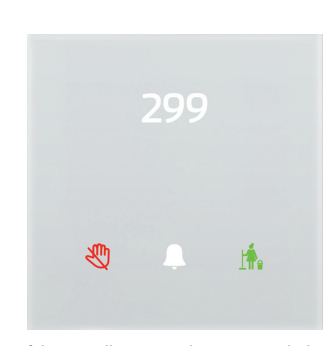
The picture of device is illustrative, the icons (symbols) are configurable by the customer.

EAN code GDB3-10/B: 8595188157261 GDB3-10/W: 8595188157278