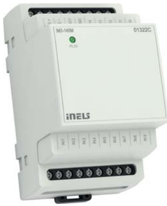
EAN code IM3-140M: 8595188132459