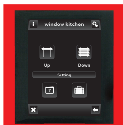
red / aluminum