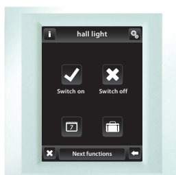
white / pearly