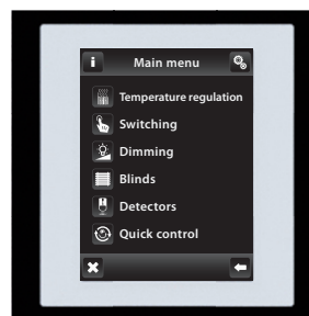
black / white