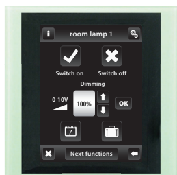
glass / grey