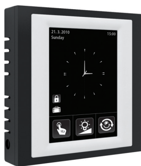
RF Touch- W