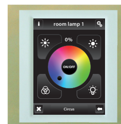
titanium / ice