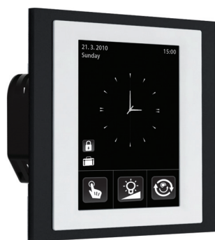
RF Touch- B