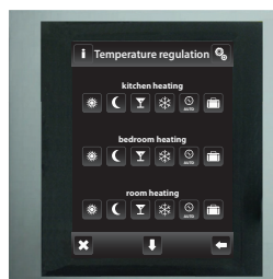
aluminum / dark grey