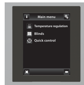
chrome / grey